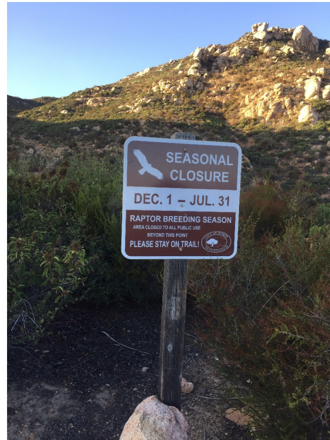
End Point of Timed Hike